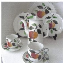
Riviera Hotel china

From the early 1930s until 1938/9, Pyne House, was also the Riviera Private Hotel. This was run by his wife. There was a restaurant and tea garden overlooking the beach.